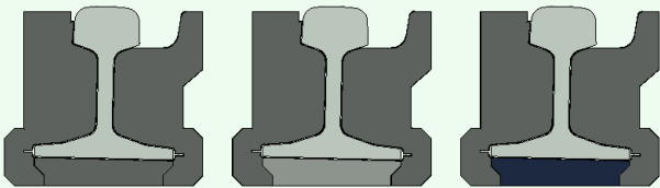
QTrack® SP Vignola rail QTrack® HP for Vignola rail QTrack® XP Vignola rail