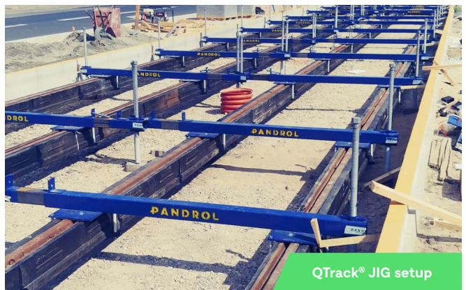
QTrack® JIG setup