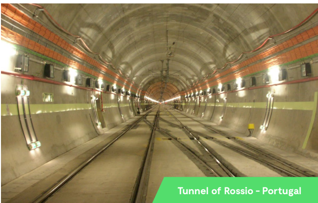
Tunnel of Rossio - Portugal