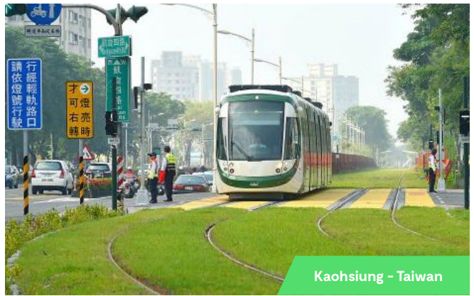
Kaohsiung - Taiwan