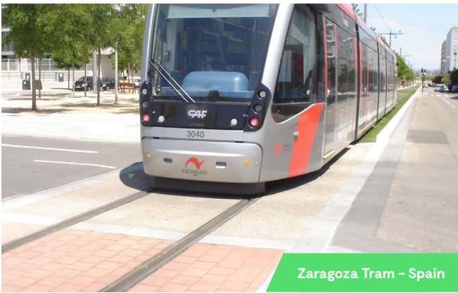
Zaragoza Tram - Spain